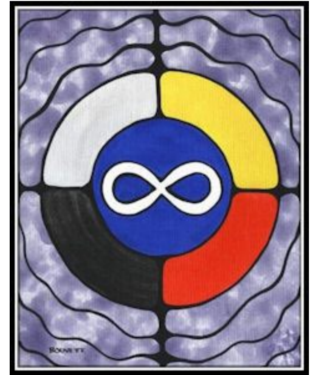
University of Saskatchewan

It is with gratitude that we now live, learn and work here where the past, present and future of Indigenous and non-Indigenous Peoples come together.