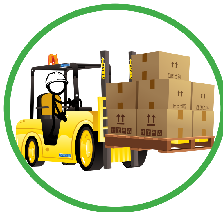
USE PROPER EQUIPMENT.