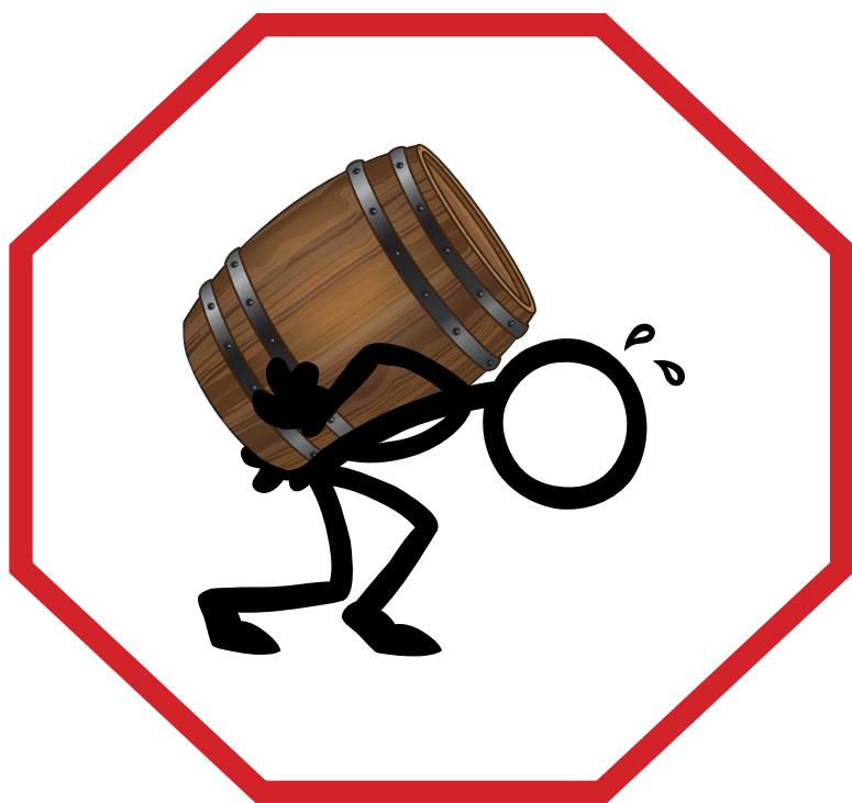
DON'T LIFT HEAVY ITEMS.