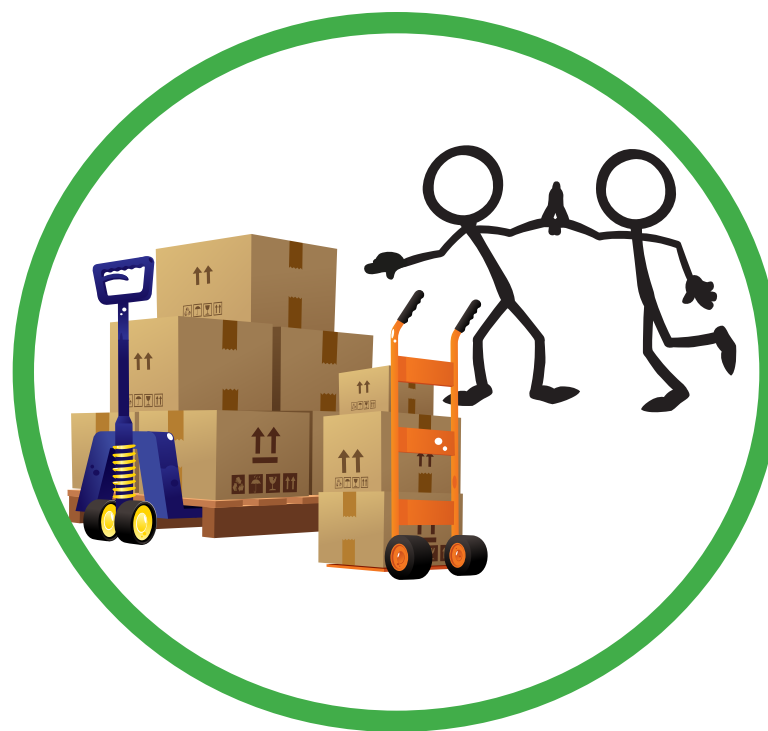
USE A HAND TRUCK OR CART.