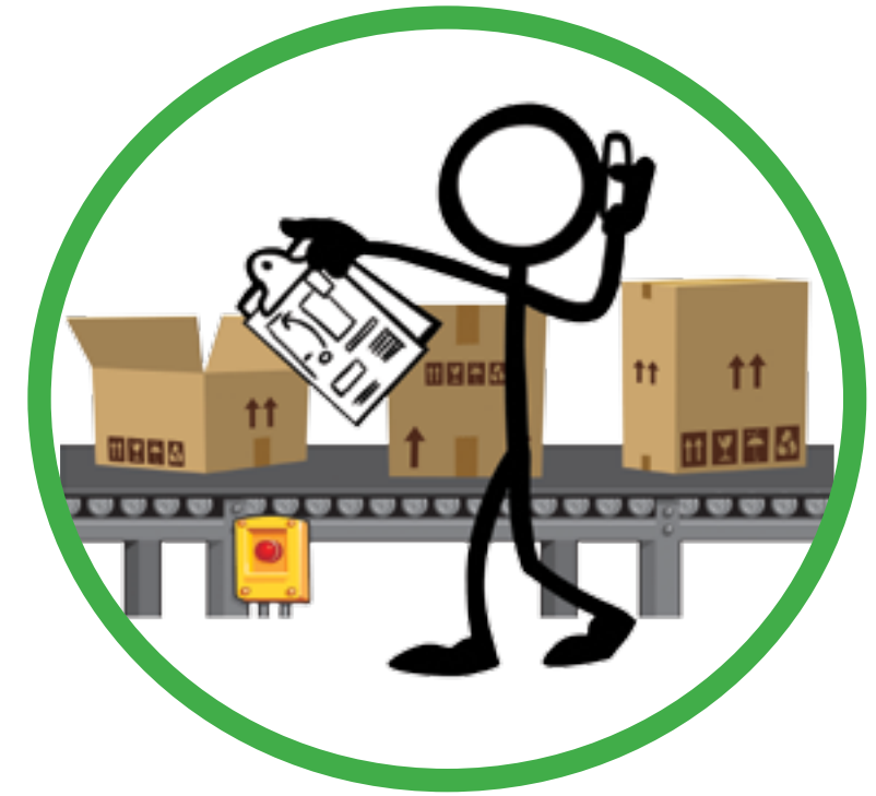
USE A CONVEYOR OR SLIDE.