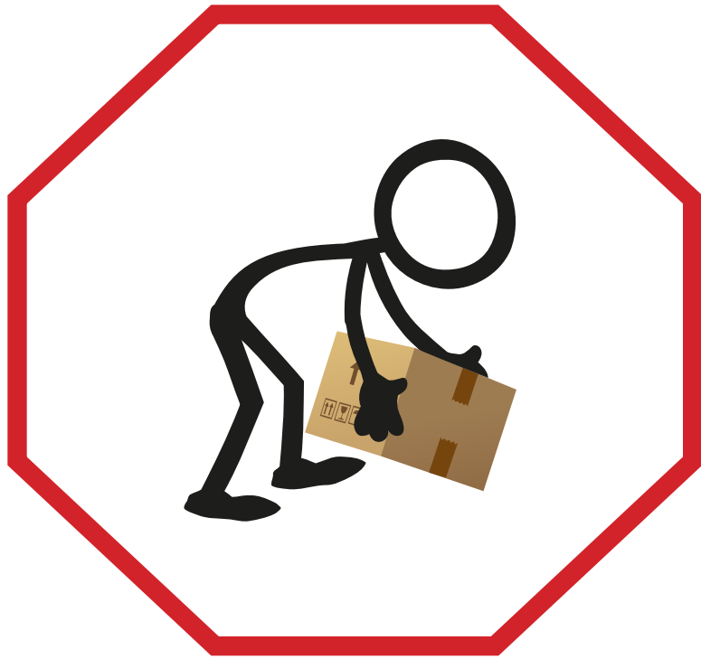
BEND AT KNEES, NOT WAIST.