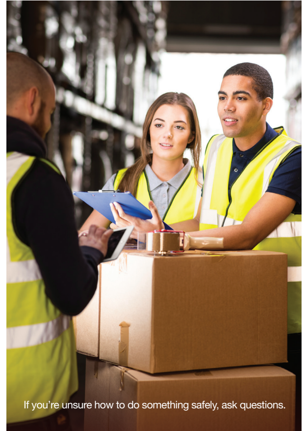
If you're unsure how to do something safely, ask questions.

the workplace. By law, you have three basic rights under The Saskatchewan Employment Act :