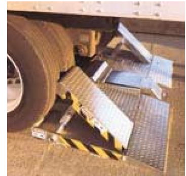
A dock-locking device