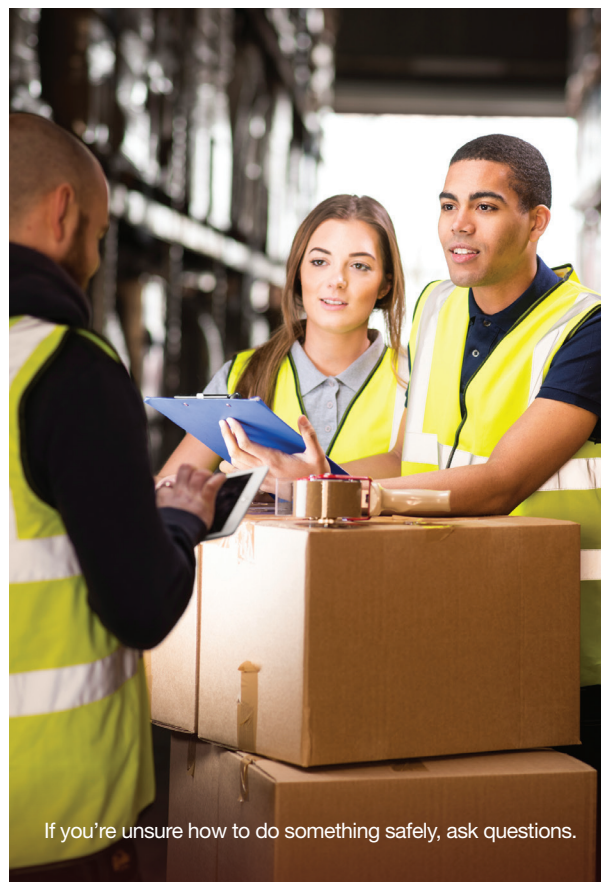
If you're unsure how to do something safely, ask questions.

the workplace. By law, you have three basic rights under The Saskatchewan Employment Act :