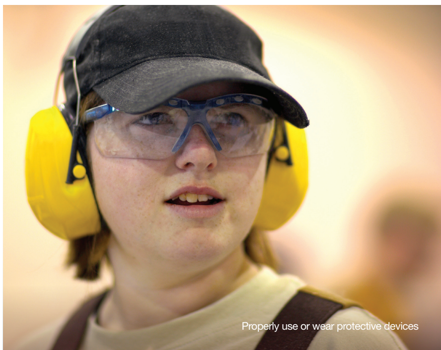
Properly use or wear protective devices

Everyone in the workplace is legally responsible for workplace safety. Before you start a new job, you should know about health and safety standards in