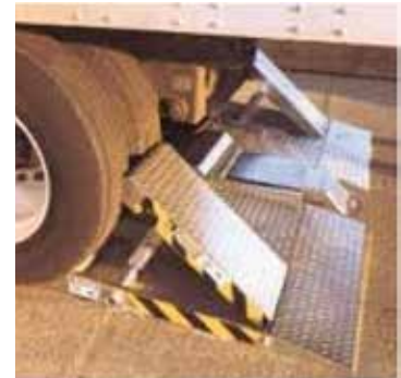
A dock-locking device